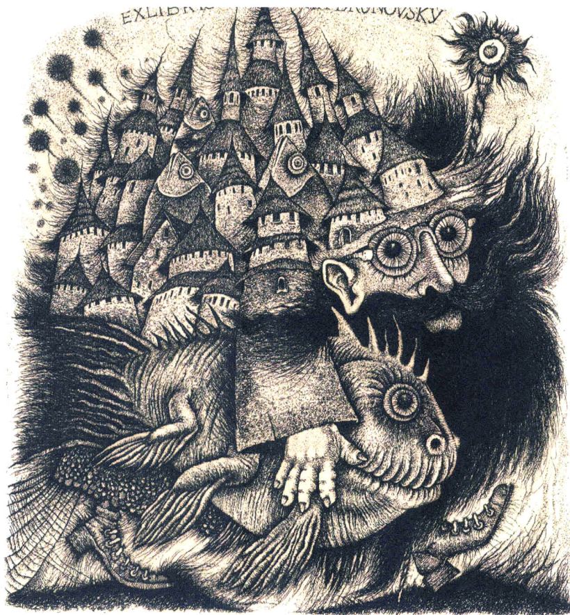
Success, 1995, 8.8 x 9.6cm