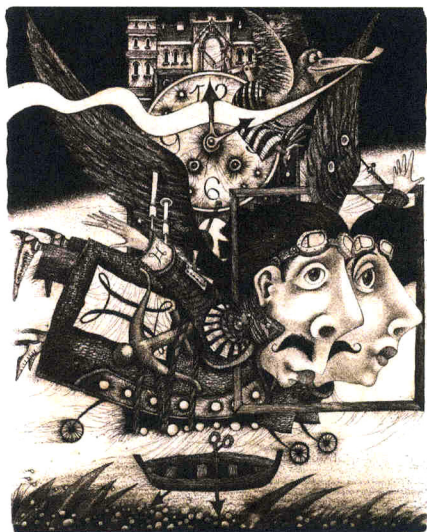
Be Fond, 1999, 10.5 x 13.1cm