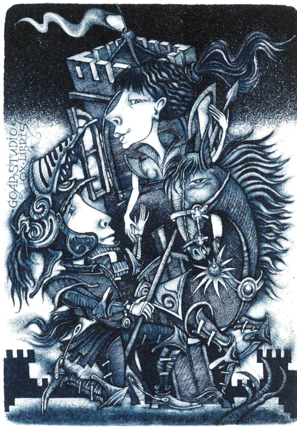
Victorius, 2015, 11.3 x 16.1cm