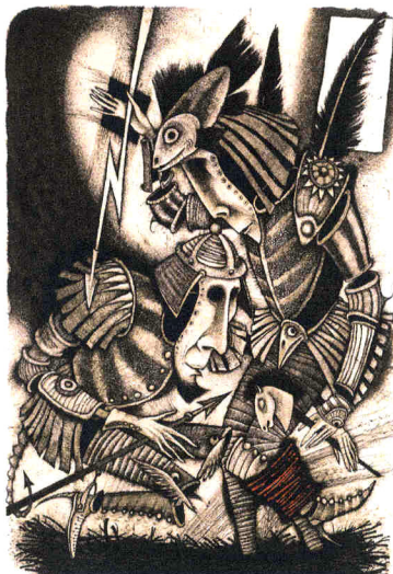
Nest, 1997, 10.1 x 14.7cm