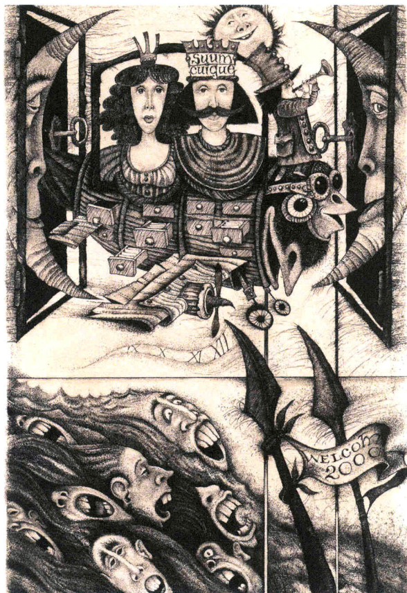
Welcome 2000, 1999, 11 x 16.6cm