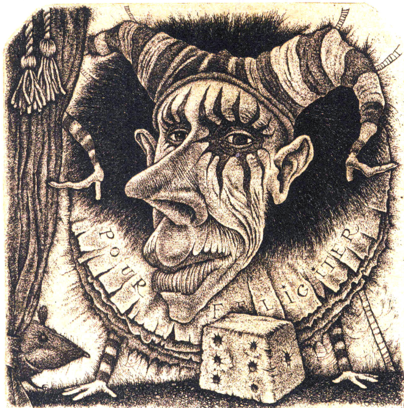
Funny, 1995, 7.6 x 7.6cm