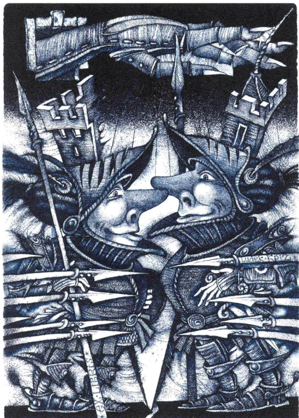
Cherchez la Femme, 2013, 10.5 x 15.1cm